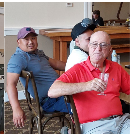
Long Drive Winner!