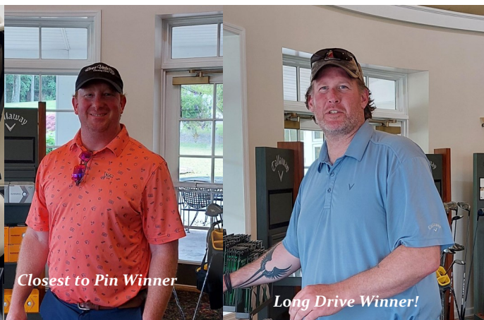
Closest to Pin Winner