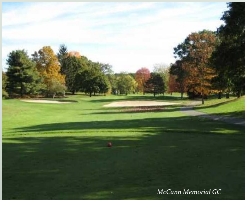
McCann Memorial GC

The Hudson Valley Golf Course Superintendents Association exists to inform, educate and serve members within the Hudson Valley and surrounding areas.